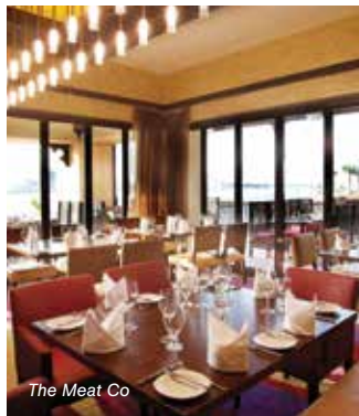
The Meat Co