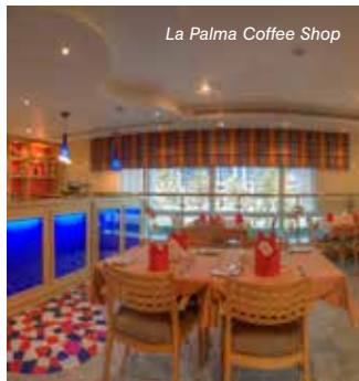
La Palma Coffee Shop