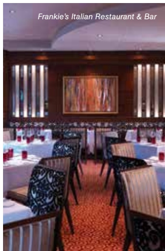
Frankie's Italian Restaurant & Bar