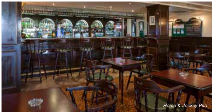
Horse & Jockey Pub