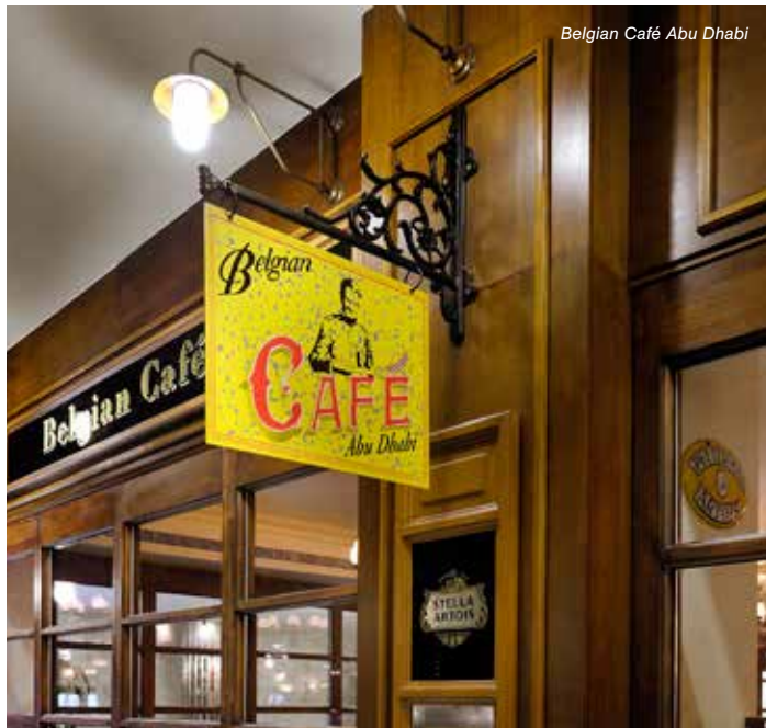
Belgian Café Abu Dhabi