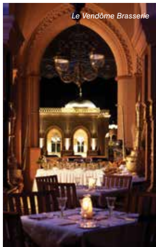
Le Vendôme Brasserie