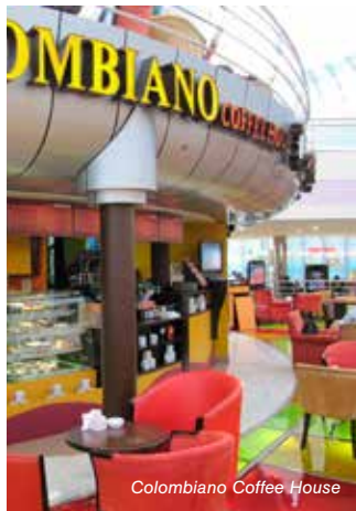
Colombiano Coffee House