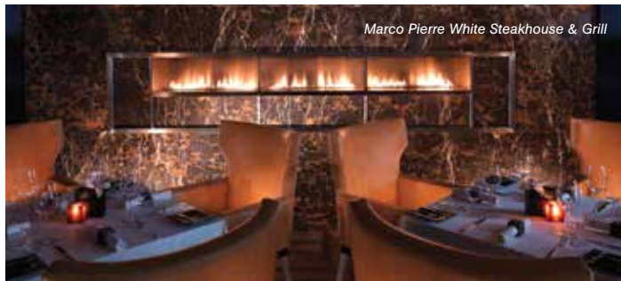
Marco Pierre White Steakhouse & Grill