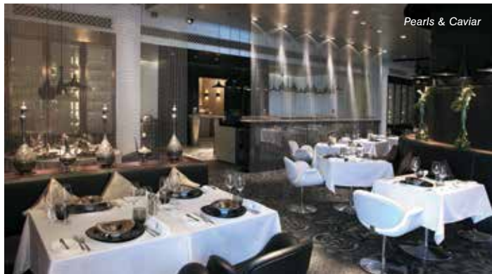
Pearls & Caviar