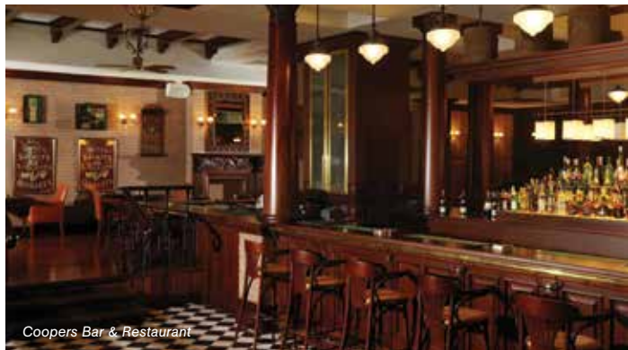
Coopers Bar & Restaurant