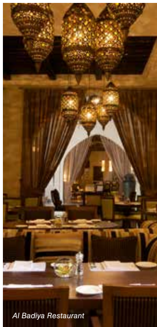
Al Badiya Restaurant