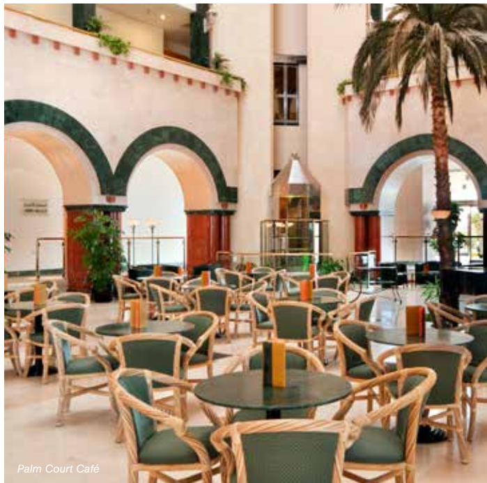
Palm Court Café