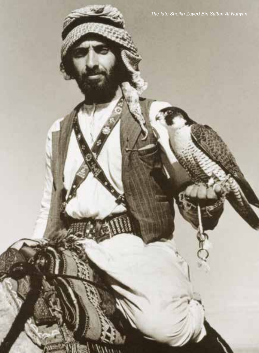
The late Sheikh Zayed Bin Sultan Al Nahyan