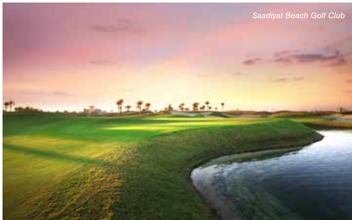
Saadiyat Beach Golf Club