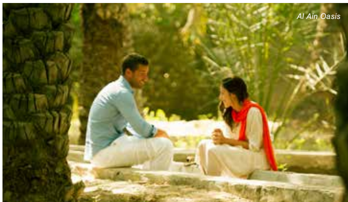
Al Ain Oasis

THIS IS A DESTINATION with almost year round sunshine, little rainfall and near perfect winter temperatures.