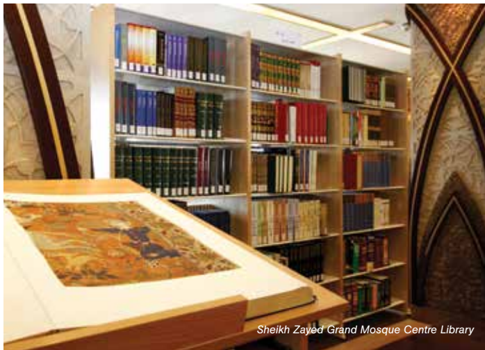
Sheikh Zayed Grand Mosque Centre Library