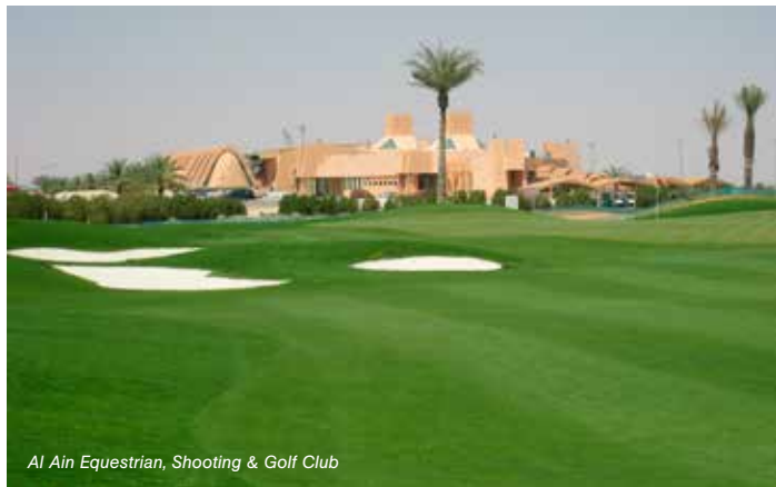
Al Ain Equestrian, Shooting & Golf Club