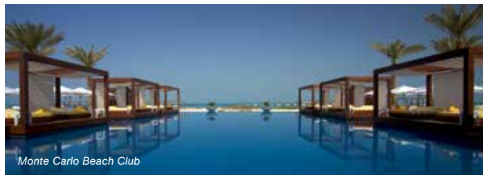
Monte Carlo Beach Club