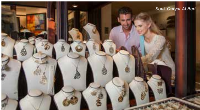
Souk Qaryat Al Beri

shops include computer suppliers and ladies' fashion outlets.