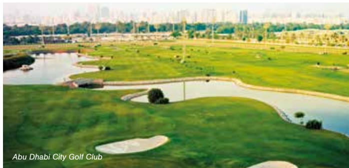
Abu Dhabi City Golf Club