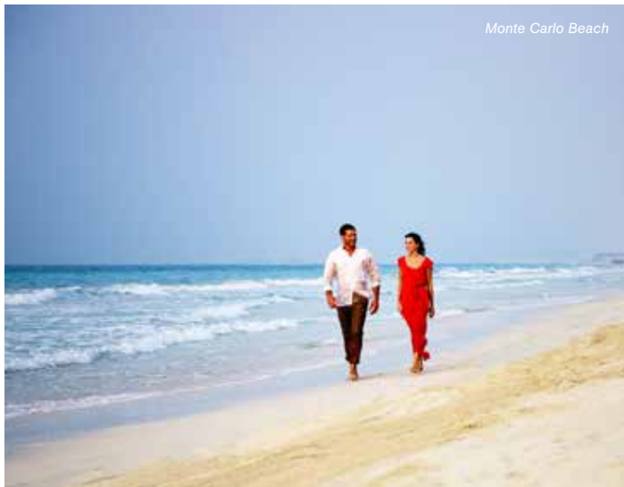
Monte Carlo Beach

EXPLORING ABU DHABI NEEDN'T be confined to the capital's streets. You can also take to the sea and view some of the islands that are scattered in the waters around the main island. The majority of the islands are flat, sandy and uninhabited, but each has its own character. Both Saadiyat